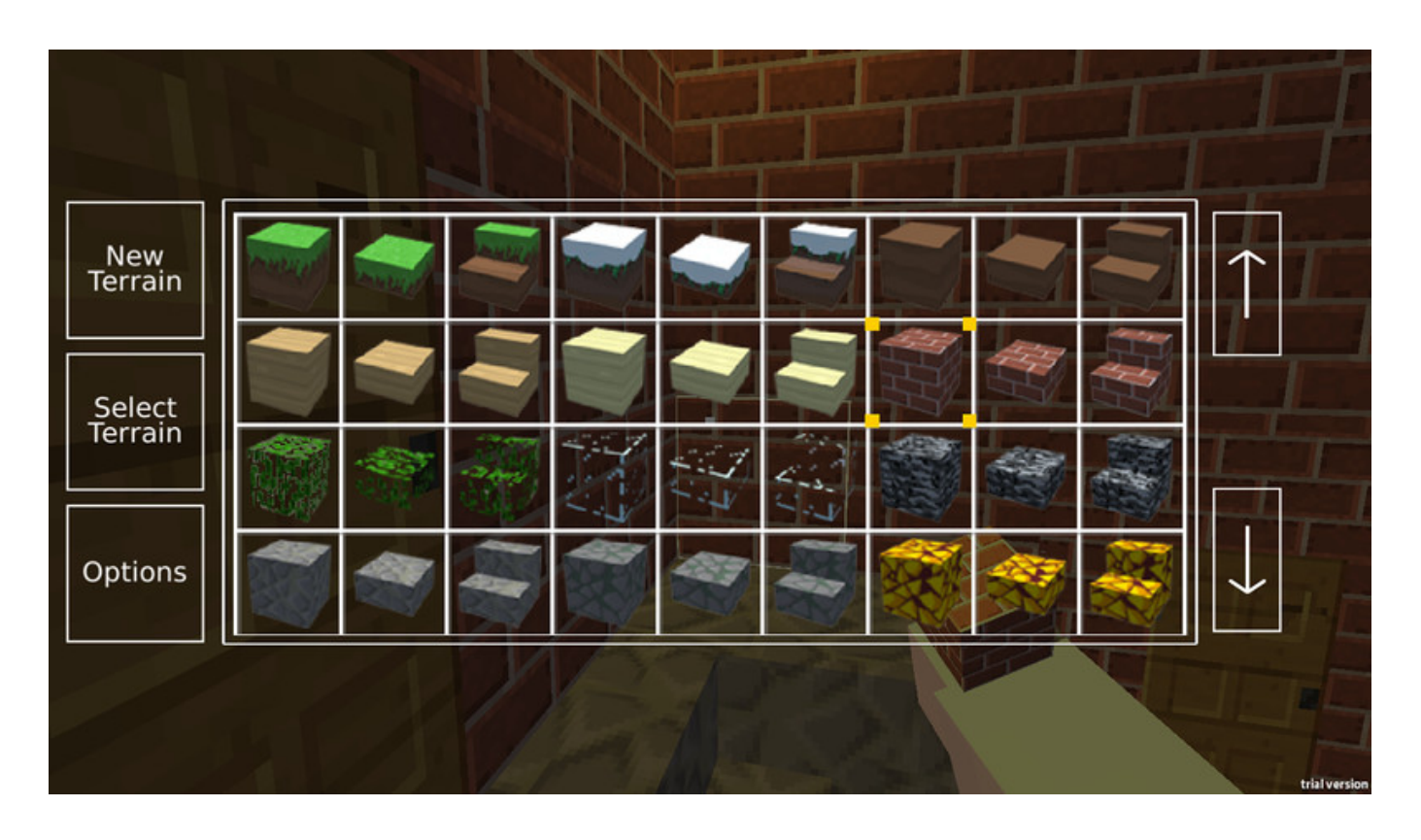
Exploration Pro Torrent Download [Crack Serial Key